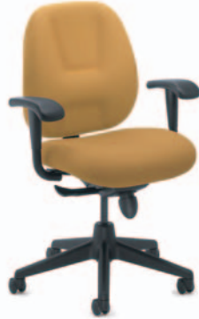
TI022 High Back