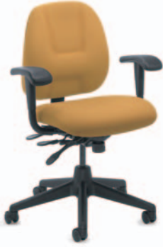
TI013 Mid Back

Shouldn't your chair work as hard as you do? And then some. TI infuses unwavering ergonomics with uncompromising comfort and unflinching affordability. So get rolling.